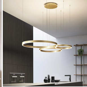
Gea Luce Criseide pendant lamp 3 LED ring lights