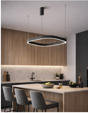
Gea Luce Criseide small square