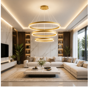
Gea Luce Criseide 3-Ring LED Pendant Light Ø 96-80-60 cm Dimmable