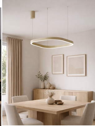
Gea Luce Criseide large square pendant lamp