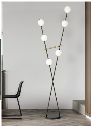
Miloox Kika 6-light floor lamp