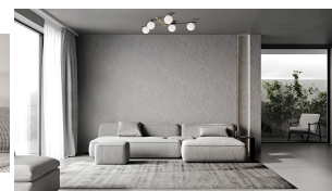
Miloox Kika 5-light ceiling lamp