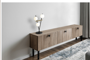
Miloox Kika 3-light table lamp