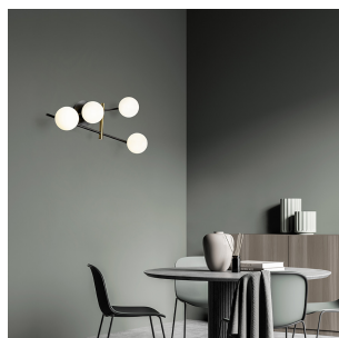
Miloox Kika 4-light wall lamp