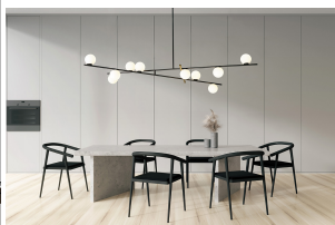
Miloox Kika 10-light pendant lamp