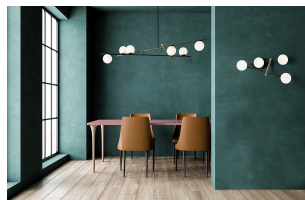
Miloox Kika 6-light pendant lamp