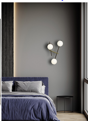
Miloox Kika 3-light wall lamp