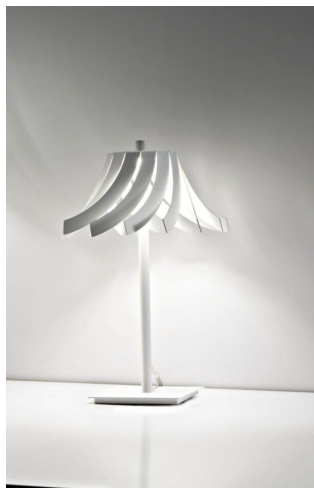
1-light table lamp - 1056 - Panama - Selene illuminazione