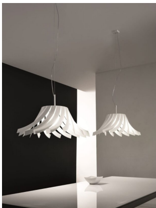
1-light suspension lamp - 1054 - Panama Selene