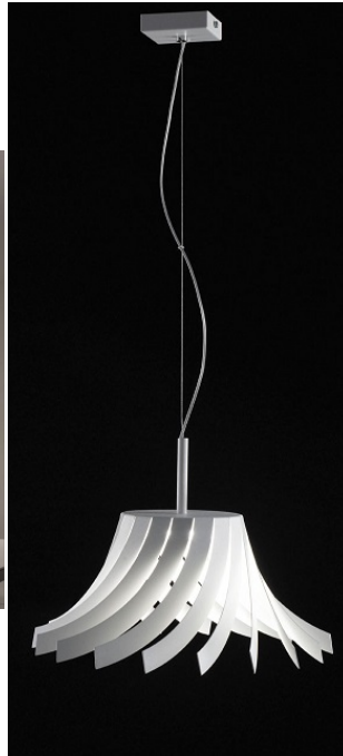
1-light suspension lamp - 1053 - Panama- Selene