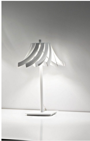
1-light table lamp - 1056 - Panama - Selene illuminazione